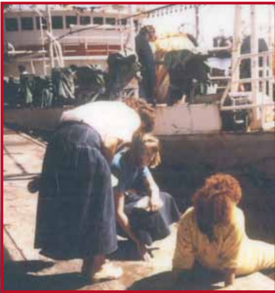
Below: Straatwerk reached out to women involved in prostitution in the Cape Town Harbour 1980 - 1998.